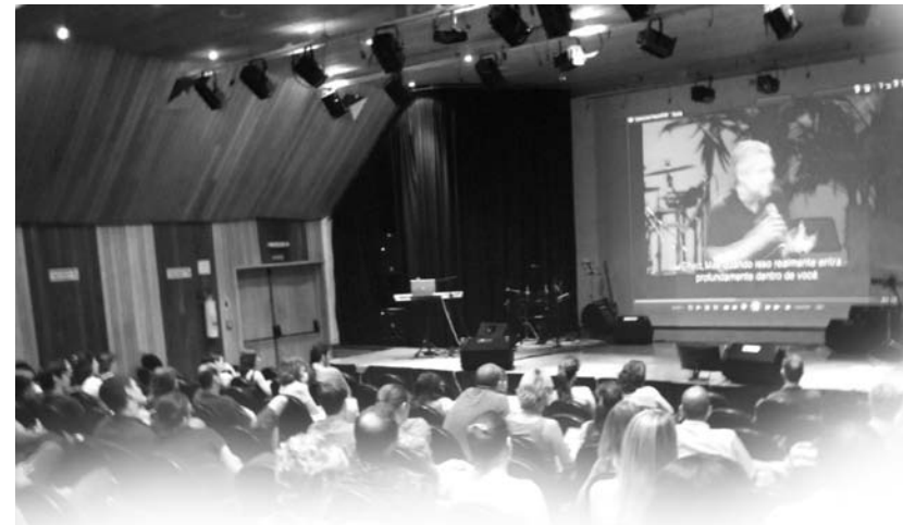
SAMPA Church in São Paulo, Brazil, shows subtitled TLC sermons on-screen every week

“ I wanted you to know that your effort does not stop with Twin Lakes, nor with the USA. God is using your work again here in São Paulo, Brazil. Later, in São Carlos, Brazil. Be very encouraged that you are loved and spiritually influential south of the Equator.”